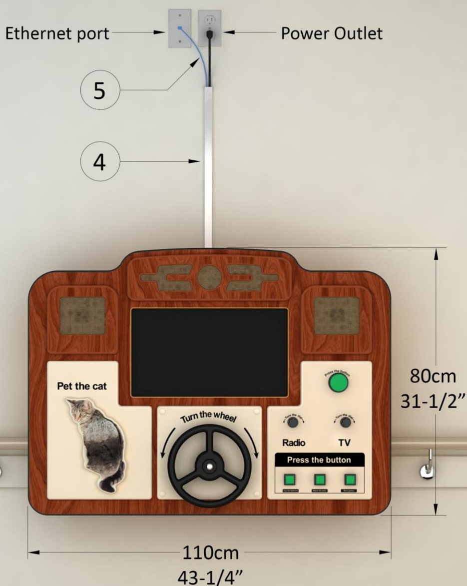
Fig 1 Preferred install configuration